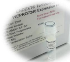
wheat germ extract WEPRO®