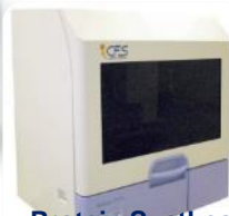
Protein Synthesizer Protelist® DTII